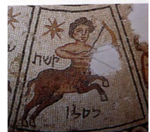
Image: old synagog mural.